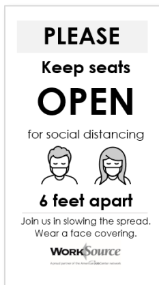
Keep seats open

Table tent card – 8.5x4.6" (8.5x14" folded in thirds)