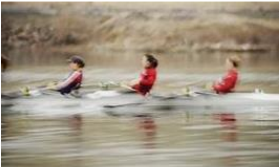
Washington State University, Rowing 101, Washington State Magazine.

It's this unified effort that allows us to maintain our high standards of customer support while navigating challenging waters.